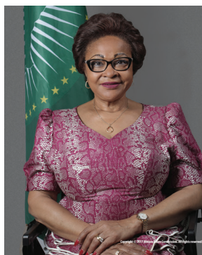
H.E. Amb. Josefa Sacko

African Union Commissioner for Agriculture, Rural Development, Blue Economy and Sustainable Environment (ARBE)