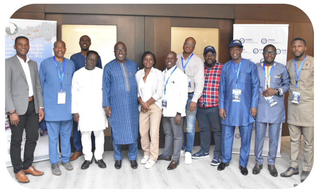
FCWC ACC Members or reps at the West Africa Task Force 16 Meeting in Monrovia, Liberia.

Comprising the Directors of the Ministries for Fisheries/Aquaculture/Maritime.