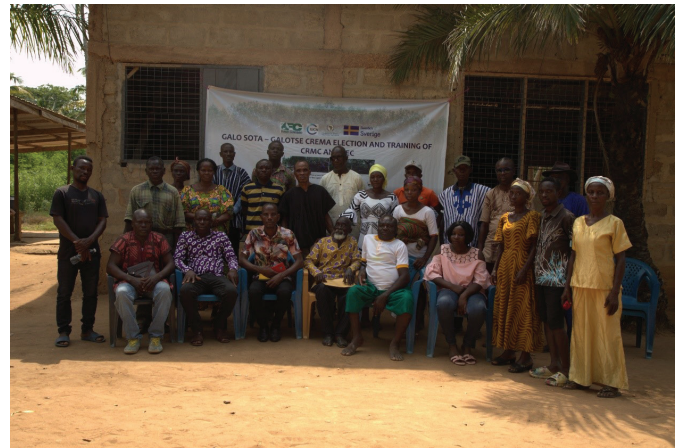
Elected Community Resource Management Committee (CRMC)

The elected executive will converge again for the training working shop towards governance of the CREMA in the coming weeks. Proposed date for this activity is the 1st and 2nd of August, 2023.