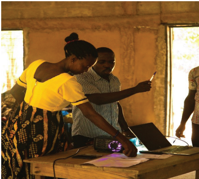
Voting process for the CREMA Executives