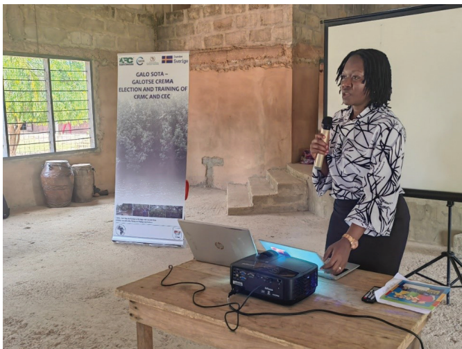
AU-IBAR Gender Expert delivering a speech on behalf of the Director of AU-IBAR