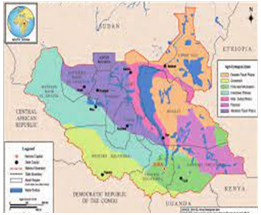
Figure 6:The seven (7) agro-ecological zones of South Sudan

The wildlife species biodiversity and richness is believed to be attributed to these varied ecological zones. Rather than the biomass diversity, a particular International importance for South Sudanese wildlife is the migrations across these ecological zones, of particular; interest is the eastern grassland savannahs and floodplains migrations along the Jonglei and Eastern Equatoria States. This migratory route stretches into the neighboring Gambela National park of Ethiopia.