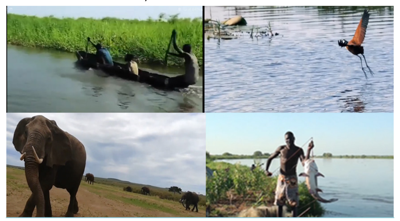
Figure 3: Biodiversity Features in the Sudd Wetlands

Environment and forestry constitute critical components for conservation of biodiversity, climate change mitigation and sustainable environmental health. The national forests on the other hand are unique ecosystems providing benefits from: biodiversity, tourism and carbon sequencing; they are also core in mineral exploration and extractions among others. The role of environment in ecosystem restoration along with maintaining the health of the environment remains critical national undertaking.