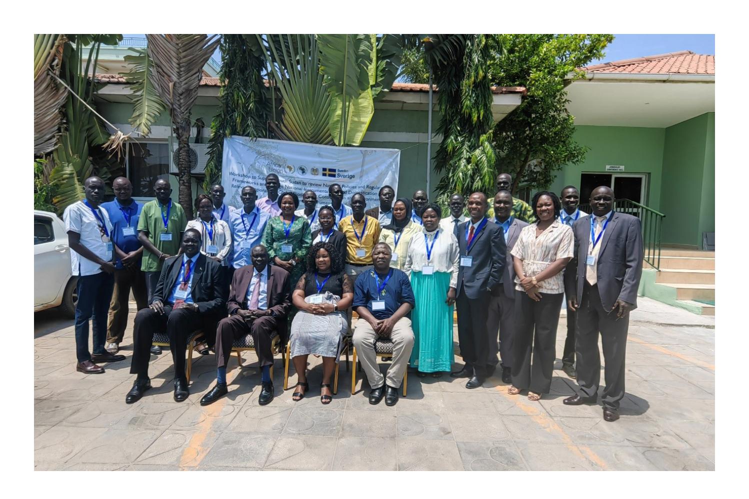
24<sup>th</sup> – 25<sup>th</sup> April, 2023 Juba, Republic of South Sudan