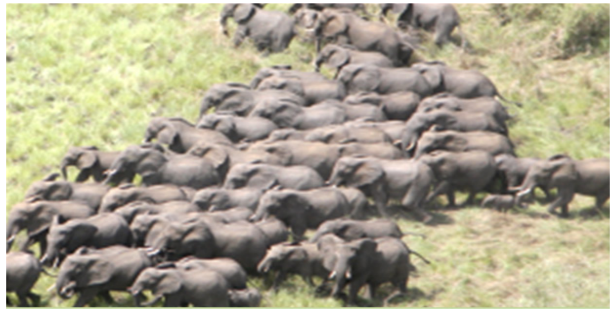
Figure 5: Spectacular migration of wildlife species along boarder with Ethiopia

South Sudan has six (6) national parks, 12 game reserves and 18 protected areas which need improvement to enable implementation of protection plans. These parks include: Nimule National park, Boma National park, Badinglo National park, the Southern National parks, the Fam-Zeraf area etc. Biodiversity conservation and environmental importance are noticed is the seasonal migration of the white-eared kob across the Boma-Badingilo and Gambella National parks, across to Ethiopia in the given savannah ecosystem making a spectacle and superlative natural wildlife migration. This particular corridor serves as an exceptional wild natural beauty of economic importance; because hundreds of thousands of animals (terrestrial biodiversity) migrate in mega-herds across this wide expanse of intact grassland ecosystem, referred to as "the Jonglei Land Scrape".