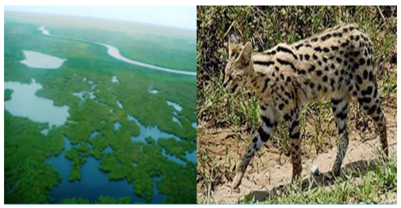
Figure 4: Aquatic and terrestrial biodiversity interactions

South Sudan has six (6) national parks, 12 game reserves and 18 protected areas which need improvement to enable implementation of protection plans. These parks include: Nimule National park, Boma National park, Badinglo National park, the Southern National parks, the Fam-Zeraf area etc. Biodiversity conservation and environmental importance are noticed is the seasonal migration of the white-eared kob across the Boma-Badingilo and Gambella National parks, across to Ethiopia in the given savannah ecosystem making a spectacle and superlative natural wildlife migration. This particular corridor serves as an exceptional wild natural beauty of economic importance; because hundreds of thousands of animals (terrestrial biodiversity) migrate in mega-herds across this wide expanse of intact grassland ecosystem, referred to as "the Jonglei Land Scrape".