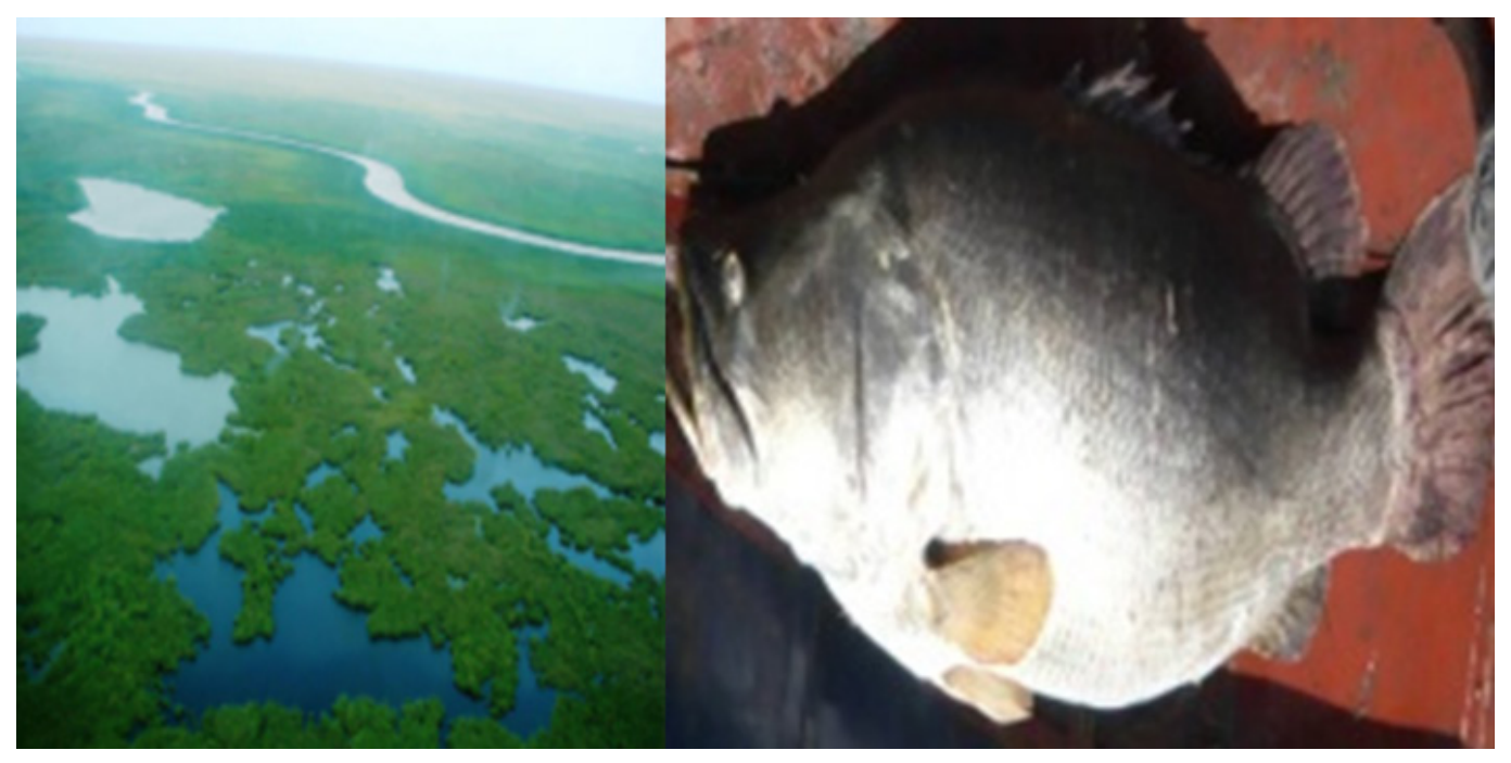
Figure (1): Sudd Wetlands and the interactive aquatic biodiversity in South Sudan

related floodplains which have sufficient water retention in the dry season for aquatic biodiversity and environmental service as well as for terrestrial biodiversity including watering for livestock (CAMP, 2013).