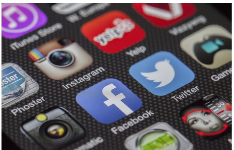
The communication and visibility plan of Fish Gov 2 Project

Presented and some suggestions to improve implementation